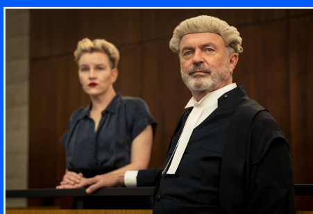
The Twelve Warner Bros.